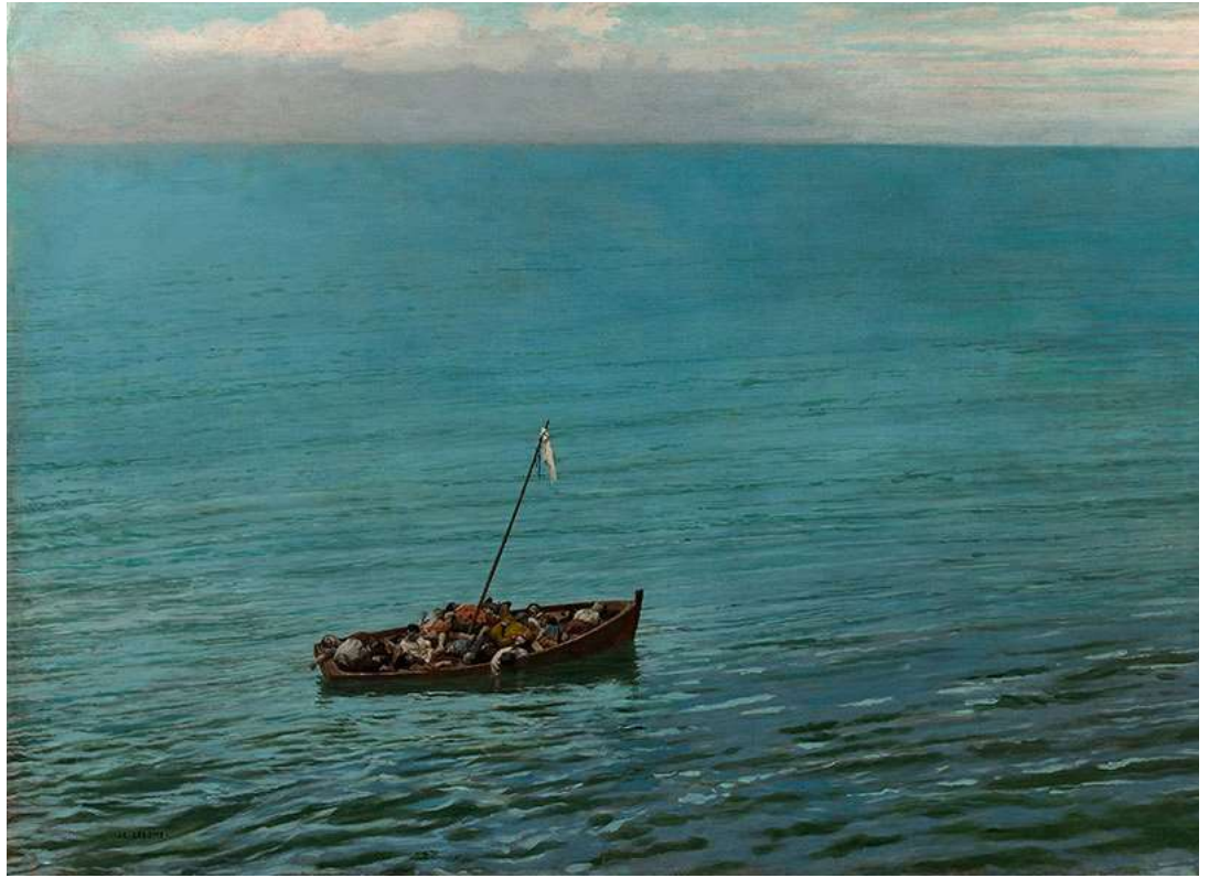
Jean-Léon Gérôme, Une épave. Est. 80 000 - 120 000€.

PARIS.- At the Hôtel Drouot and throughout seven auctions, Daguerre will be offering at auction an exceptional collection discovered during a valuation in a Paris apartment. In keeping with the collector's wishes, all proceeds from the sales will be donated to the Institut Pasteur to support their scientific and medical research in preventing and treating infectious diseases.